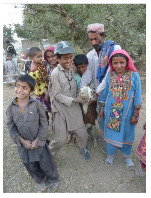
Thanks to the generous help of about 100 donors until today we could construct houses for 17 families in 4 villages. For the coming relief actions we will concentrate on one village in SINDH, GOTH RADAK.