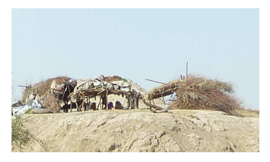
There are about 20 families living under conditions the 3 photos are showing.