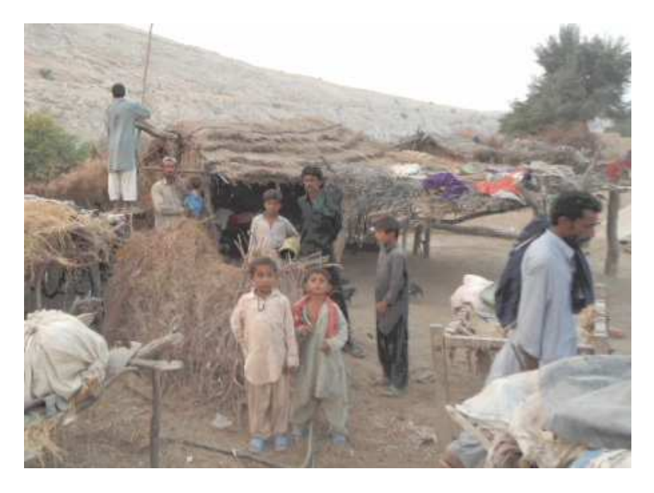
Our aim is, to help them as soon as possible!