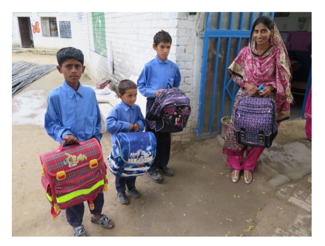
The school bags are most welcome

On the first day in PAKISTAN we visit briefly SAYA SCHOOL & WELFARE HOSPITAL MEER KOH which we are supporting since long and hand over the donated school bags donated from people in LEONBERG / GERMANY and about 200 glasses donated by several donors from the area LÜNEBURG / GERMANY and from Federal Country SCHLESWIG-HOLSTEIN / GERMANY. With joy we have seen that the construction work was started for an extension of the school in MEER KOH. Soon the children will no longer need to be taught outdoors and in two shifts, because sufficient classrooms will be available.