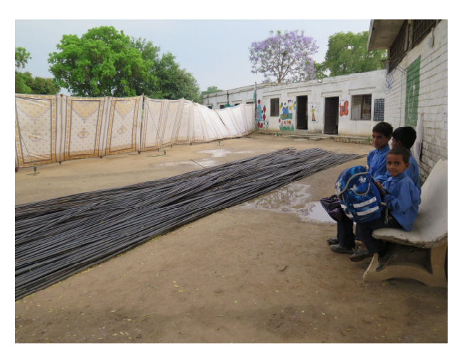
Behind the partitions foundations for the new 8 classrooms are under construction