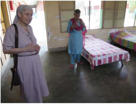
Mother Superior Hend