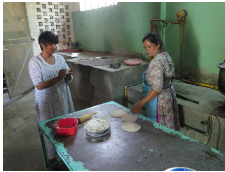
Kitchen for 115 people