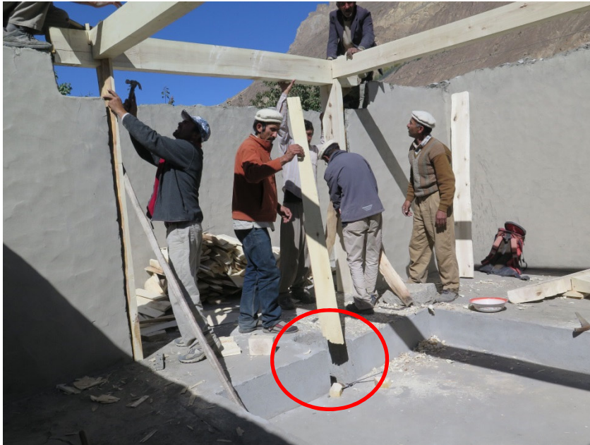
Fireplace in a house constructed in October 2014

The Shimshalis listened with great interest, as we described them the relatively easy to be built stone ovens, which are found in the mountains in the Alps.