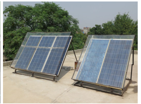
Urgent Action required